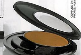
Under Eye Concealer in Light. Revlon £7.33 For sparkling eyes, banish under-eye darkness with liquid concealer. Choose a lighter shade than your skin tone.