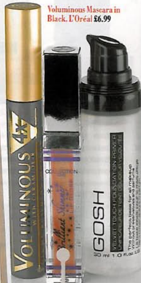
Voluminous Mascara in Black. L'Oréal £6.99

“L'Oréal's volume-boosting mascara instantly makes me look presentable.” BEYONCÉ KNOWLES